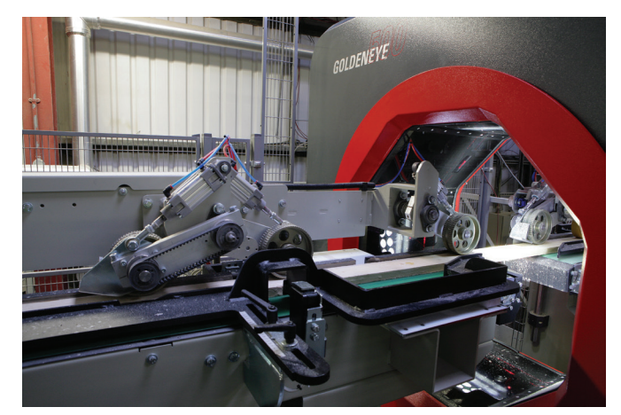
Goldeneye, roofing batten scanning line.

Marley has a wealth of expertise and outstanding knowledge of the roofing and timber markets. At our specialist timber manufacturing site in Gainsborough, timber battens for roofing are manufactured using a state-of-the-art, dedicated roofing batten scanning line, Goldeneye, which scans each timber batten intricately by the millimetre to ensure compliance with BS 5534.