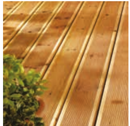
...and after the cleaning