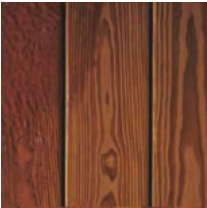
Strip off any old coating before redecorating the deck – you might like the look of the wood you reveal.

All traces of a previous paint or stain should be removed by scraping, sanding or using a product made especially for stripping coatings from wood. When using deck cleaning or stripping products always follow the manufacturer's instructions.