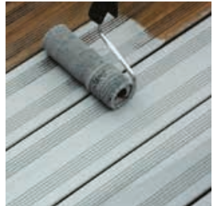
Owatrol solid colour stain applied by roller