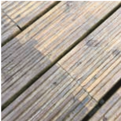
A 15 year old deck mid its annual clean

Once the deck is clean and dry a surface treatment can be applied that provides weather resistance and enhances the natural shade of the wood or gives the deck a brand new look. Surface treatments range from clear waterproofing sealers to tinted and solid stains. Always follow the manufacturer's instructions.