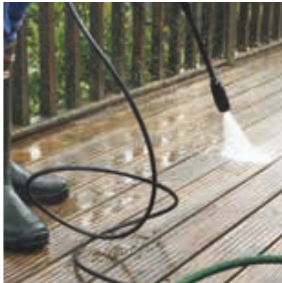
Pressure washing can be too aggressive – use with care