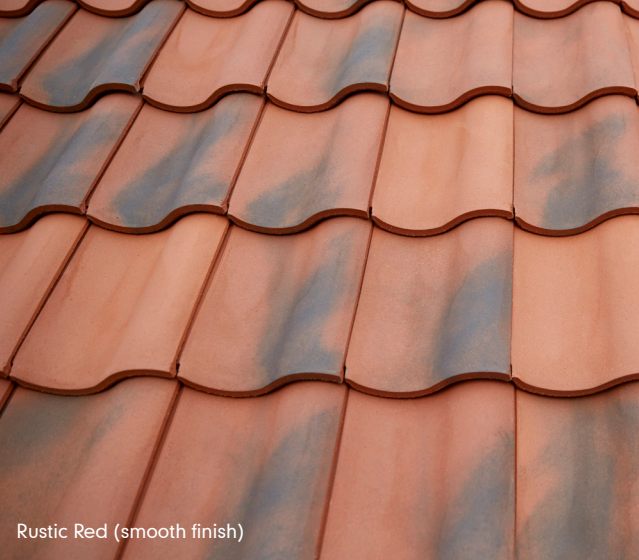
Rustic Red (smooth finish)