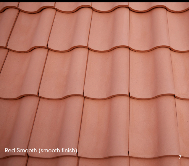
Red Smooth (smooth finish)