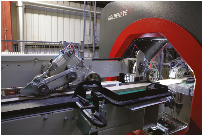
Goldeneye, roofing batten scanning line.

What happens at Gainsborough is only part of the story. Selecting the right timber to use for roofing battens is very important. Using our extensive network of Scandinavian mills, we source only slow-grown timber to ensure strength and durability. All our battens are cut from kiln dried side boards as they are less likely to distort. All Marley timbers are legally and sustainably sourced and in accordance with the UK Timber Regulations, supplied with PEFC Certification. As members of Timber Development UK, Marley supports the Responsible Purchasing Scheme.